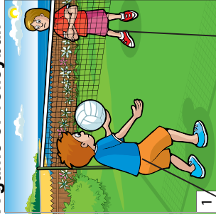
A game of volleyball